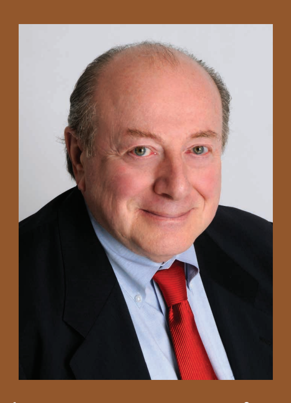
"I stake my reputation on its performance and on your satisfaction with it."