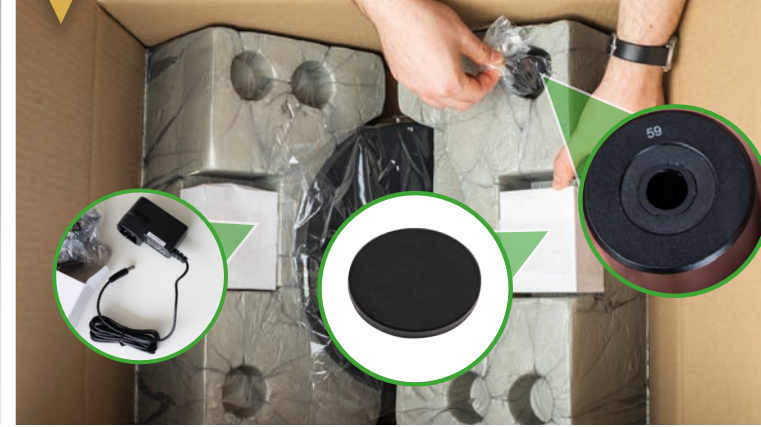
Unpack the platter.

Unpack power supply, record puck and counterweight from the bottom inserts.