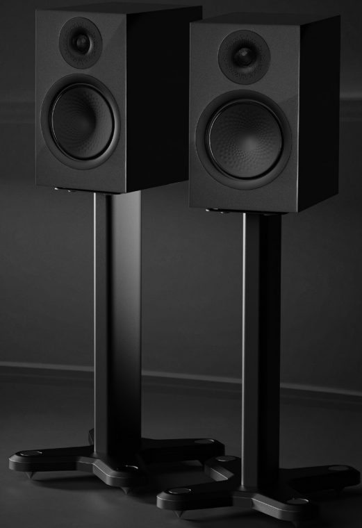
Silver 100 7G Limited Edition - Carbon Black Metallic

Available in strictly limited numbers, these are not just speakers - they're collectibles for those who demand the extraordinary.