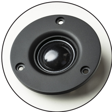
1" silk dome tweeter

For transparent and smooth treble response.